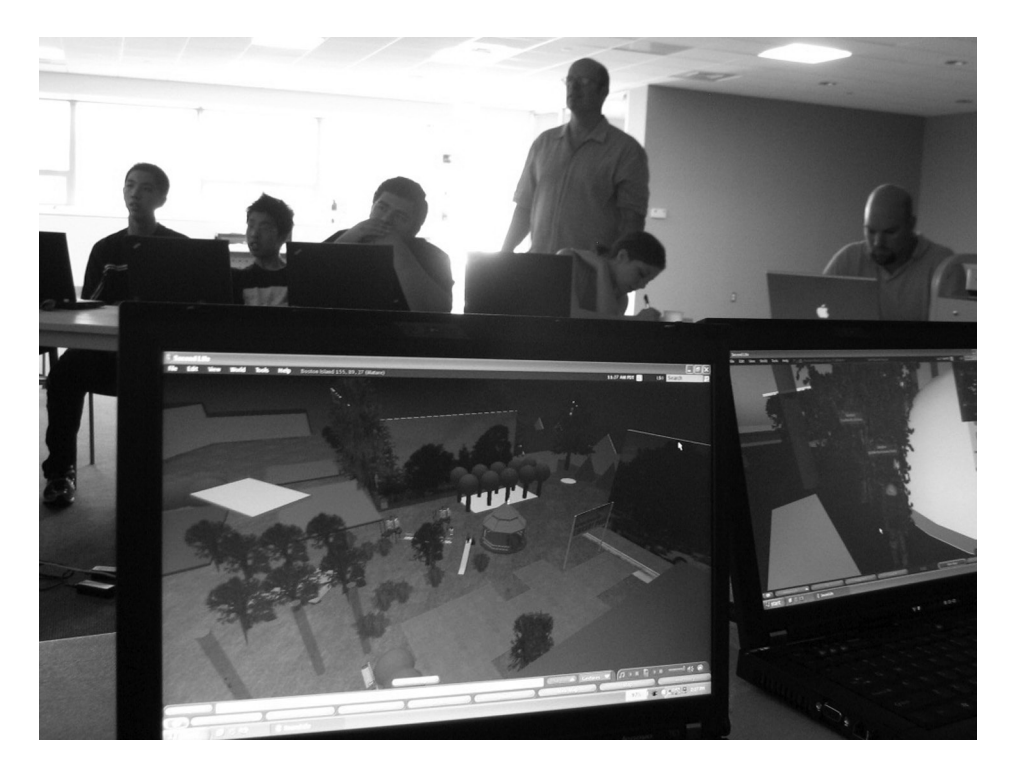
Figure 1. Group gathered at a Hub2 workshop with the Second Life space in the foreground

where groups of participants immersed themselves in a virtual space, moved things around, proposed ideas, role played, and experienced various spatial configurations. It also included informal drop-in hours, where community members individually experienced the design and contributed their ideas in the online conversation about the park. The project was designed as a supplement to traditional community meetings that were facilitated at the same time by ADG.